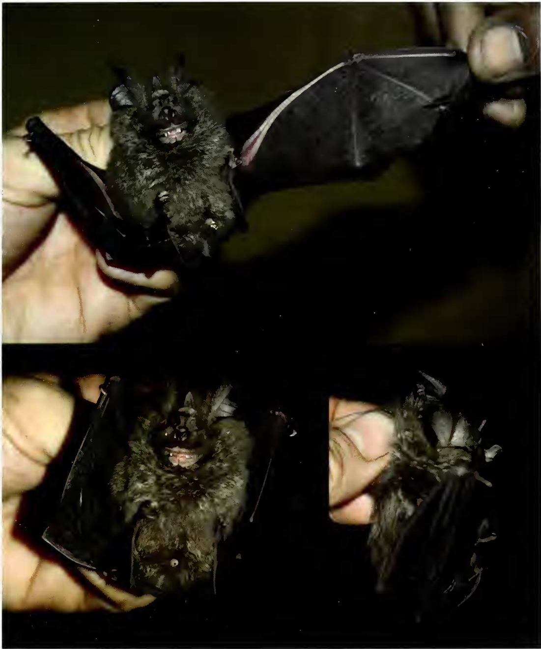
Fig. 3. Photographs of the holotype (FMNH 195182) of Rhinolophus willardi sp. nov.

glenoid in ventral view broad and strut-like for a length of 1.2 mm before it steps down anteriorly. Canine and second upper premolar almost in contact, anterior upper premolar extruded from the tooth row. Mast nearly equal to Zyg (ratio: 0.97–1.02).